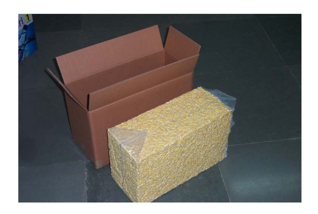
MOULDED VACUUM PACK FOR AFD CORN