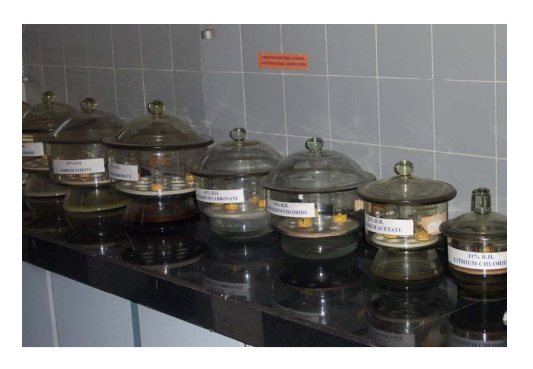
SORPTION ISOTHERM STUDIES