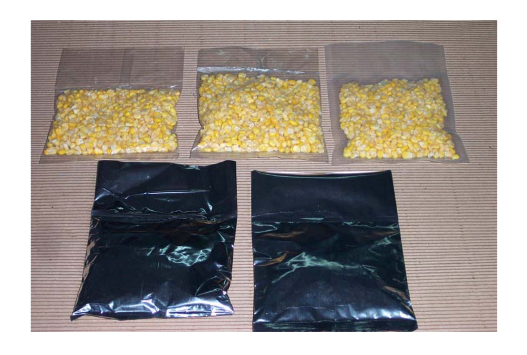
ORDINARY AND GAS FLUSHED POUCHES OF AFD CORM